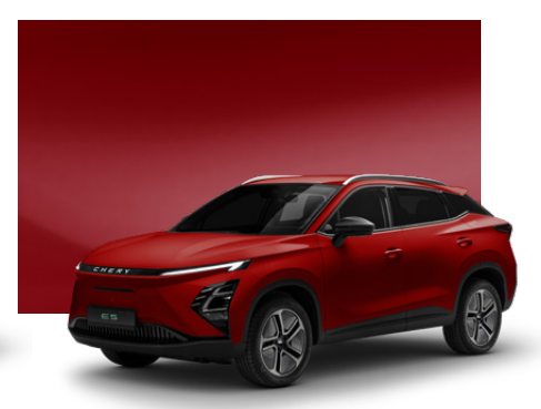
Optional Black Roof*

Available at additional cost (Ultimate models)