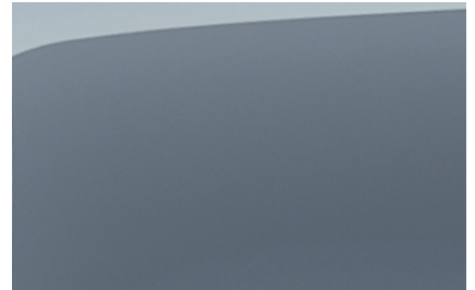
Mercurial Grey* (GV)