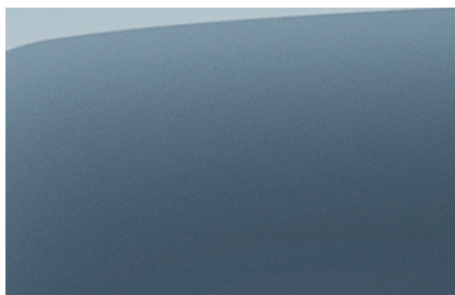
Star Silver* (KH)