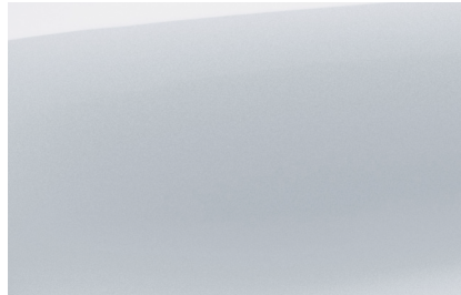
Lunar White* (BW)