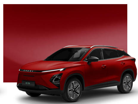
Optional Black Roof*

Available at additional cost (Ultimate models)