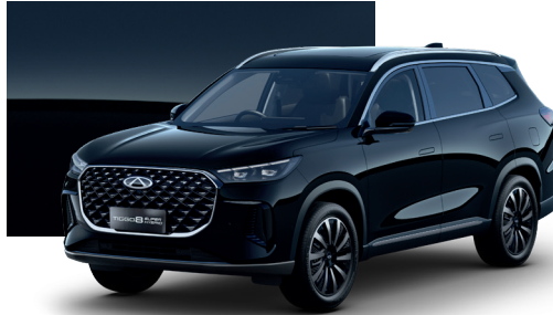
Space Black (CL)*