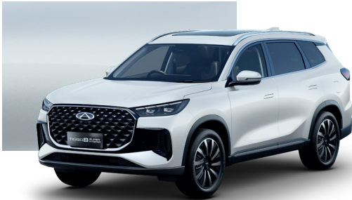
Lunar White (BW)*