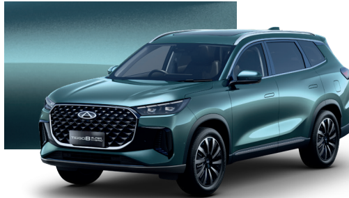
Bamboo Grey (UM)*