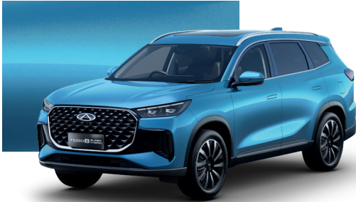
Azure Blue (LM)